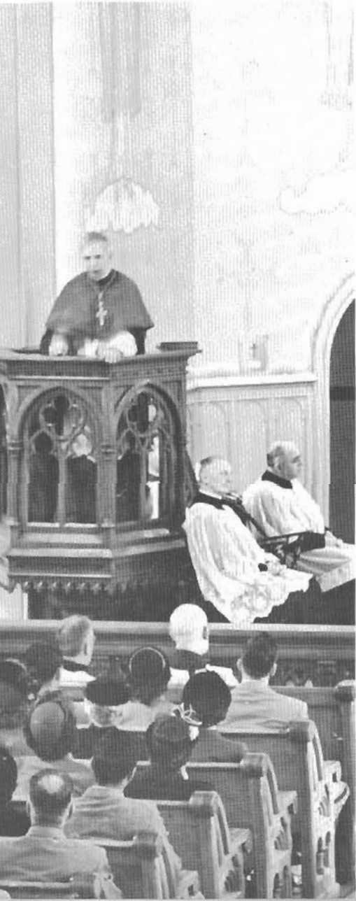
Blessing of renovated church after fire—Sept., 1951

That house was renovated and converted into the kindergarten (first floor), the organist's quarters on the second floor.